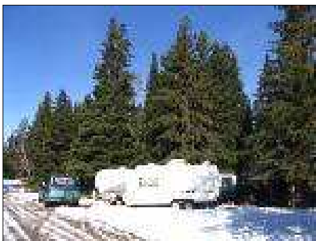
Star party camping in Powassan.

"...IYA2009 is first and foremost, an activity for the citizens of planet Earth."