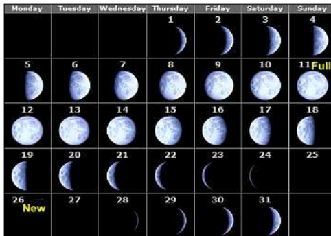
Moon Phases for January 2009