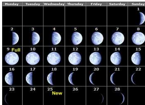
Moon Phases for February 2009