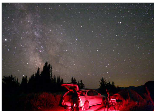
Mt. Kobau, BC 2008

"Astronomers say the universe is finite, which is a comforting thought for those people who can't remember where they put things." -