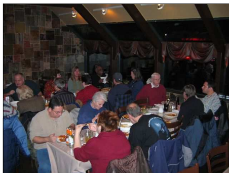
Christmas party at Chatters after the December meeting—eating...our second most favourite thing to do!

"RASC members are perhaps uniquely positioned to explain and promote responsible lighting."