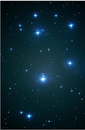
Photo of Pleiades