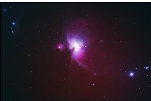
Photo of Orion Nebula